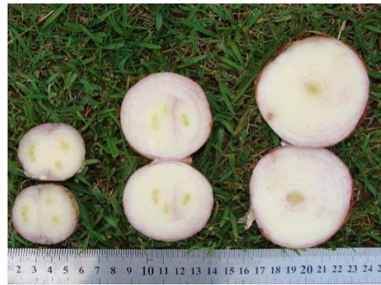
Figure 1: Transverse sections of onion cultivars (a) Cv.1 (b) Cv.2 showing horizontal diameters of large, medium and small sized bulbs, grown under un-shaded, partially and fully-shaded.